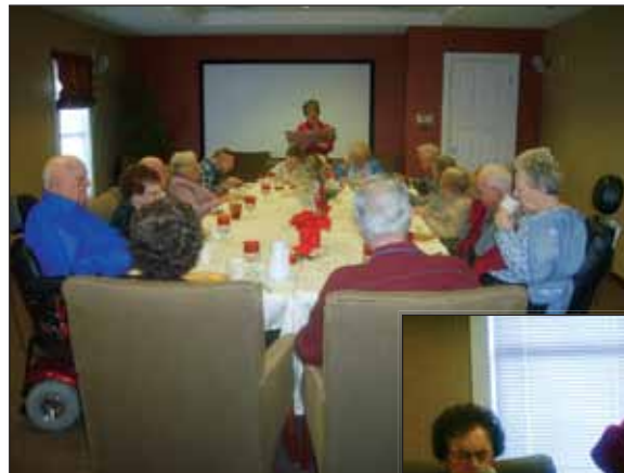
Our couples enjoying the Valentine's dinner.