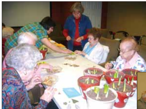
Working with Columbus Master Garden Club.

These are important answers to have as a child of an aging parent. Do you need help in getting the process started? Contact us for a free consultation and ongoing support. Simply put, the needs of our residents and seniors in the community are our utmost priority. We're here to help you navigate through the senior care issues.