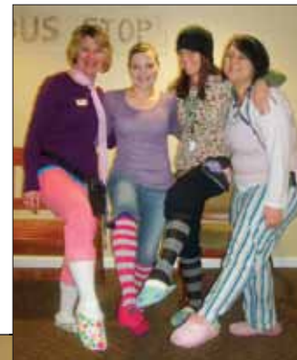
Staff enjoys Wacky Winter Wardrobe day.