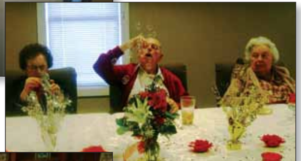
Celebrating with bubbles at the couple's dinner.